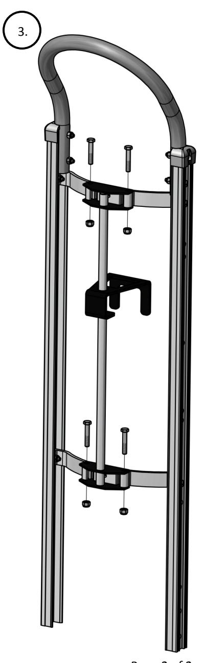
8200-137 Sliding Keg Hook Assembly Instructions