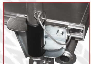
Picture of Saftey Pin

Constructed from the same components as our convertibles, Studio Carts are built for strength and durability.